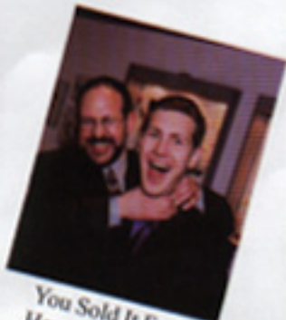
You Sold It For How Much...!?!