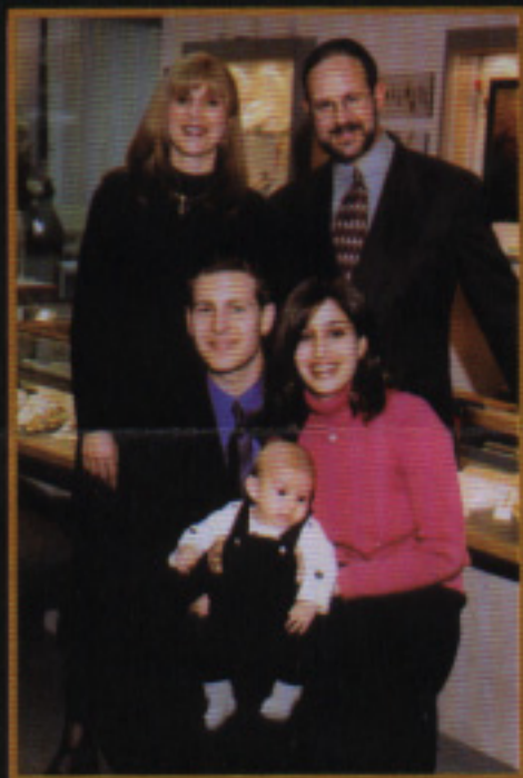
Families helping families

Beautiful, newly arrived and exciting fine quality jewelry will be auctioned.